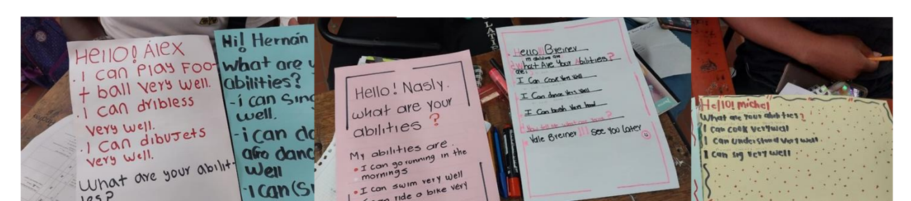
Figure 3. Sentences from their notebooks on pieces of cardboards. Modal verb Can

In this segment, which lasted 15 minutes, the groups interchanged ideas in Spanish, all the time. Once again, from the metacognitive perspective, the goal was accomplished; but the mother tongue was an interference in the English oral production.