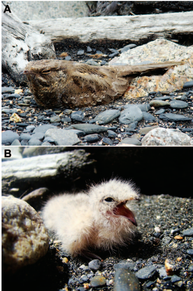
FIGURE 1. The Ladder-tailed Nightjar ( Hydropsalis climacocerca ) is a ground-nesting bird, and nests are found on islands and river edges. (A) Female incubating eggs and (B) 3-day-old nestling.