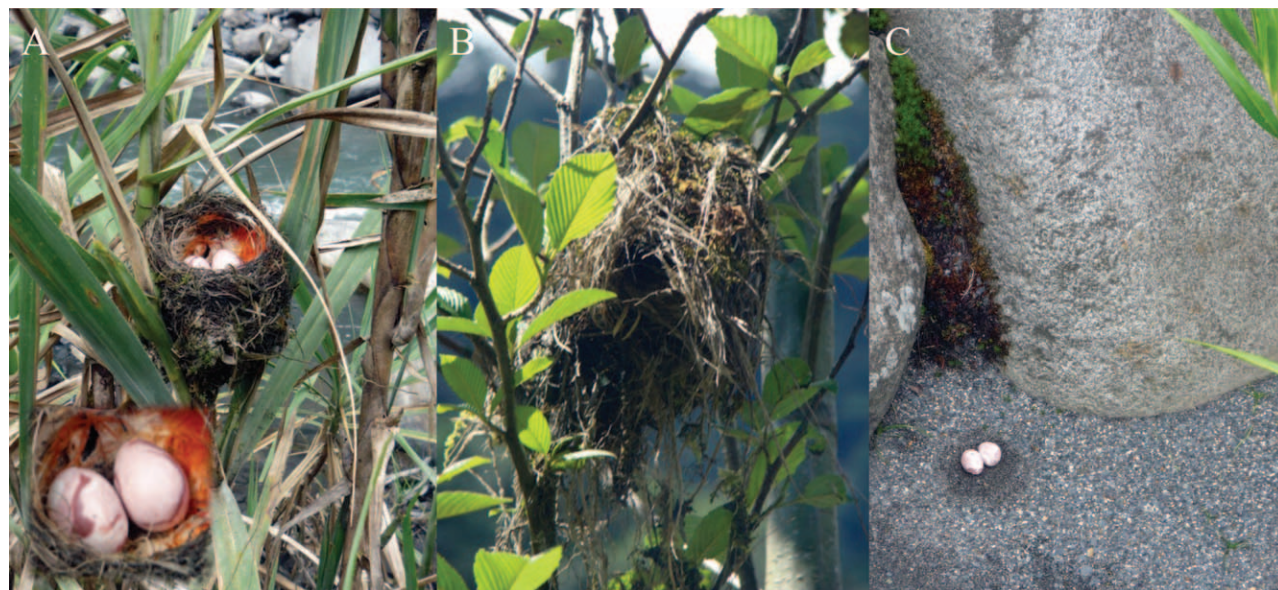
FIGURE 3. Nest types used during the artificial nest experiment. (A) Cup nest, and a close-up of the 2 plasticine eggs. (B) Dome nest. (C) Ground nest.

To compare predation rates between natural and artificial nests, we used a Wilcoxon signed-rank test for paired samples. We used contingency-table analyses to test our response variable (successful–failed nest) against our possible predictor variables: location of nest (island–river edge), type of nest (dome–cup–ground), and height of nest (ground–vegetation). Additionally, we calculated daily survival rates (DSR; i.e. the probability that a nest will survive a single day) using Program Mark (White and Burnham 1999) with a generalization of the estimator of maximum-likelihood analysis (Bart and Robson 1982). For each nest, the model required (1) the day it was found; (2) the last day it was checked when alive; (3) the last day it was checked; and (4) its fate (0 = successful, 1 = depredated). We incorporated nest location, type of nest, and height as covariables. Model support was evaluated using Akaike’s Information Criterion (AIC; Dinsmore et al. 2002). To calculate the probability of nesting success, we used species with known nesting periods (duration of incubation and